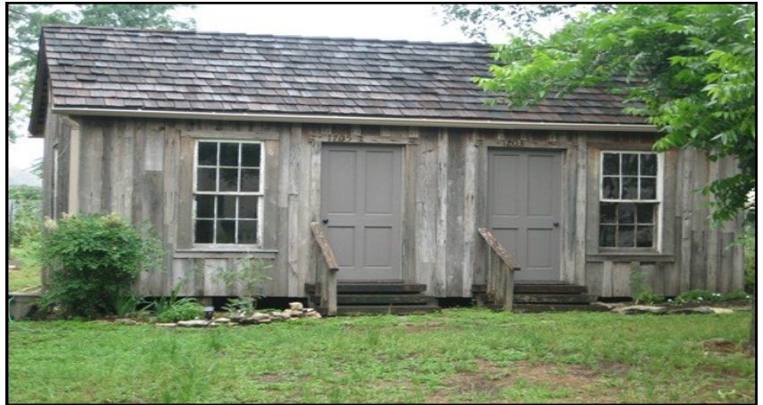
Haskell House c. 1875