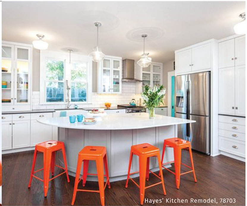
Hayes' Kitchen Remodel, 78703

We design and build around you so you feel right, at home.