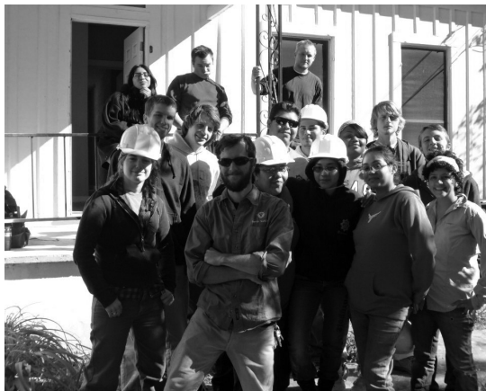
Photographs of the W. 11th Street renovations by Kris Burns, Casa Verde Builders